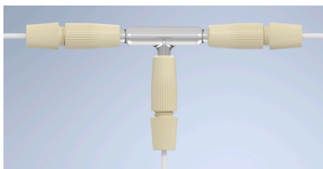
Trident CT Mixing Chamber Glass with 1/4-28 Connectors, P/N 60-703-1119 .

The heart of the kit is the mixing chamber, designed with zero dead volume CT fittings.