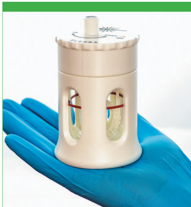
Figure 1: Elegra argon humidifier with bypass switch.

ICP-MS is being used more often, in place of ICP-OES and AA techniques, for trace metals analysis of high matrix samples like seawater and geological samples. For this reason, a dilution gas is now a standard option on most ICP-MS instruments (1–3). Inline “aerosol dilution” of the sample prior to introduction into the plasma greatly improves the plasma robustness, allowing for improved analysis of high matrix samples by ICP-MS. High matrix samples also need to be diluted for ICP-MS analysis in order to prevent the rapid build-up of salt deposits on the interface cones, which would otherwise result in signal drift. Relying on aerosol dilution rather than offline dilution of the samples (4) prevents errors associated with manual sample preparation. The Elegra Dual uniquely allows for humidification of both the nebulizer gas and dilution gas for these types of ICP-MS setups.