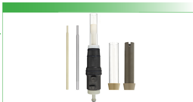
Figure 1: Glass Expansion D-Torch for Agilent 5100/5110 and 5800/5900 ICP-OES instrument.

The D-Torch (Figure 1) is a robust and higher-performing alternative to both a single-piece and a semi-demountable quartz torch. Compared to other demountable torches, the D-Torch is the only torch design that comes standard with a ceramic intermediate tube for greater robustness and a lower cost of ownership. With the D-Torch design, the analyst most often replaces only the outer tube, rather than replacing the entire torch or a quartz torch body. With demountable torch designs offered by other manufacturers, the intermediate tube is made of quartz and fused to the quartz outer tube, which is an additional consumable whose cost can quickly add up and negate the economic benefits of the torch itself. The D-Torch also features fully interchangeable injectors, allowing the analyst to install a specific injector (i.e., material and inner diameter) for each application, whether it be for aqueous,