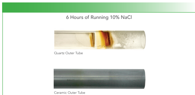
Figure 2: A Comparison of resistance to devitrification when exposed to high salt matrix.