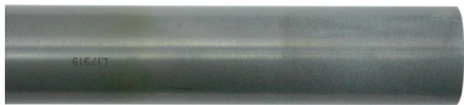
Ceramic outer tube

A combination of high temperature and salt deposit causes a quartz torch to devitrify. Higher concentrations of salt in the samples lead to more rapid devitrification. The quartz torch in the photo was run for only 6 hours with samples containing 10% NaCl and is already badly degraded. By contrast, the ceramic material does not devitrify and is not affected by salt deposits.